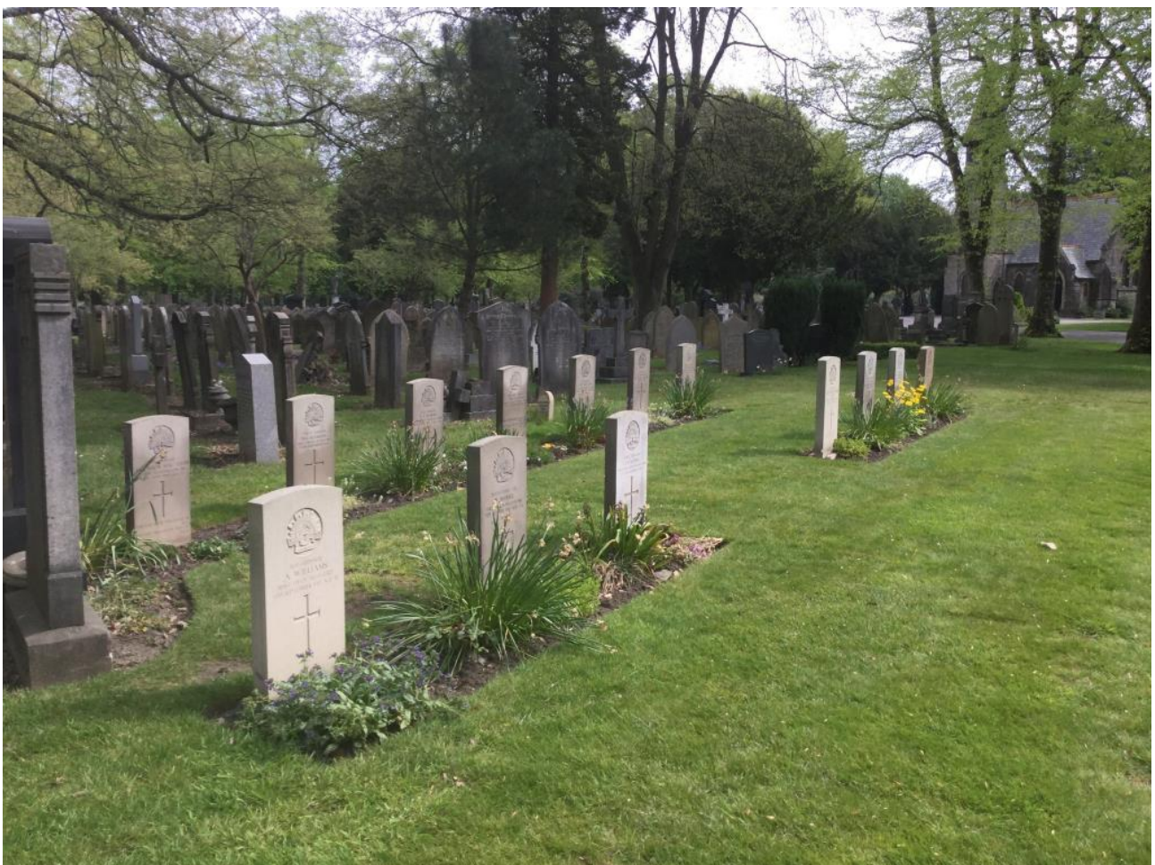
Australian Plot in Southern Cemetery, Manchester