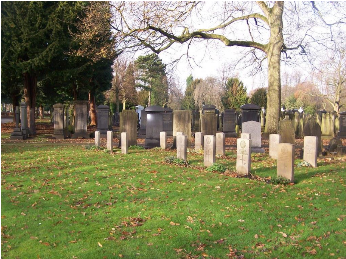
Southern Cemetery, Manchester – showing the 14 Australian War Graves from WW1